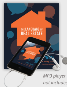
MP3 player not included

Enroll Today at www.KapRE.com/TXLIC | 800.638.9529